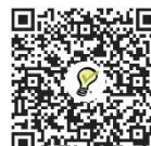
Emmanuel picnic - Sign-up

We are asking for members to contribute cold sides and desserts. More information about this event, volunteer opportunities, and to RSVP can be found at this link: https://www.signupgenius.com/go/30E0A4FADA82DAA8-55229381-2025 , or the provided QR code. A paper sign-up is also available on the table in the MEC. Please RSVP by Monday, March 24.