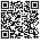
Family Easter Festival - Volunteers