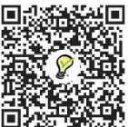
Emmanuel picnic - Sign-up

We are asking for members to contribute cold sides and desserts. More information about this event, volunteer opportunities, and to RSVP can be found at this link: https://www.signupgenius.com/go/30E0A4FADA82DAA8-55229381-2025 , or the provided QR code. A paper sign-up is also available on the table in the MEC. Please RSVP by Monday, March 24.